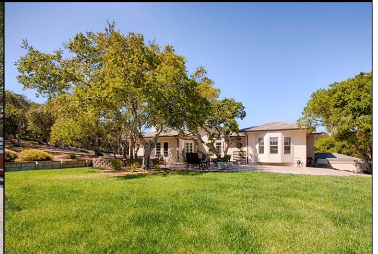
LEVEL REAR YARD

300 SKY PARK DRIVE | MONTEREY | 831-333-9500 | #01260773