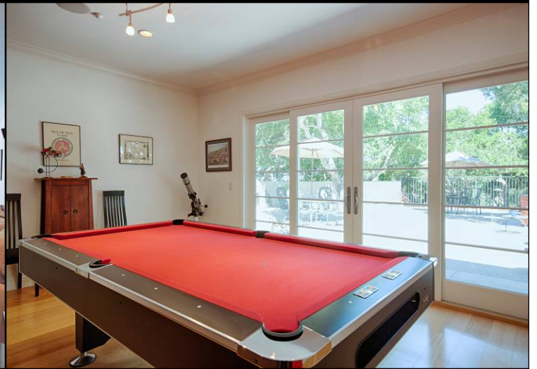
BILLIARD SPACE OPENS TO OUTSIDE