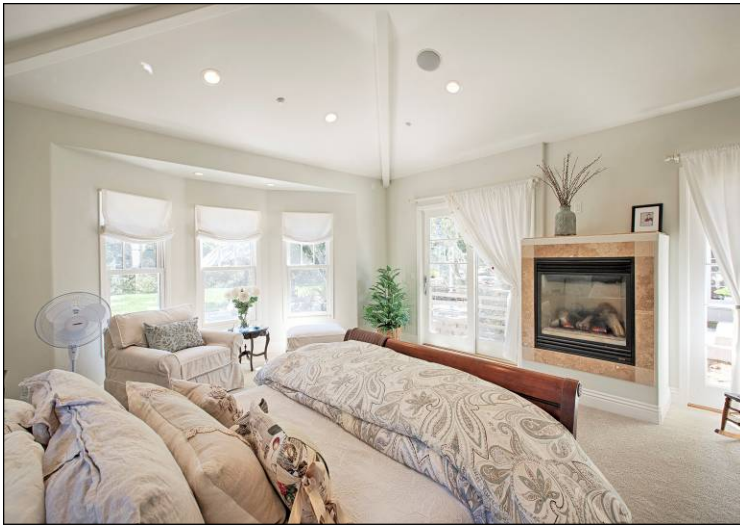
TRANQUIL MASTER BEDROOM