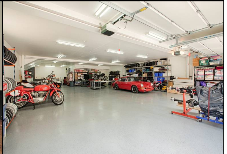
2050 SOFT ~ 8 CAR GARAGE