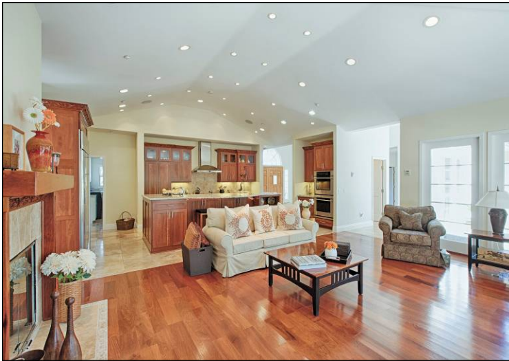
OPEN PLAN KITCHEN/FAMILY ROOM