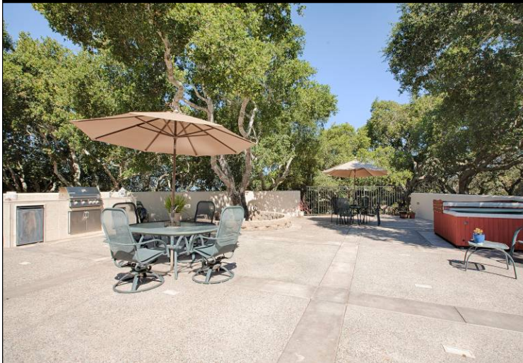
EXTENSIVE PRIVATE PATIOS