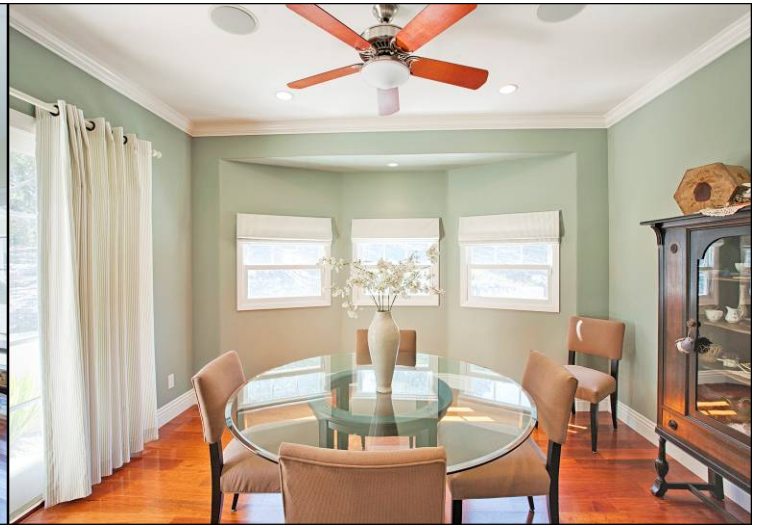
INTIMATE BREAKFAST ROOM