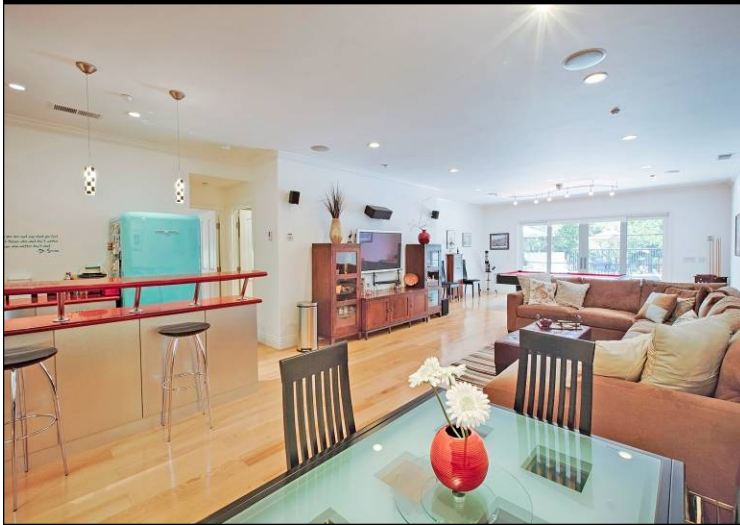
CAVERNOUS GAME ROOM