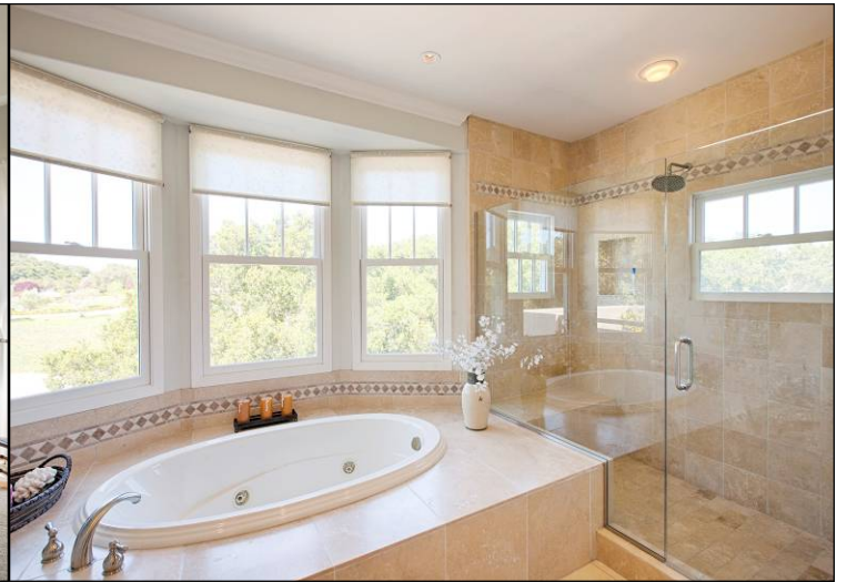
LUXURIOUS MASTER BATH