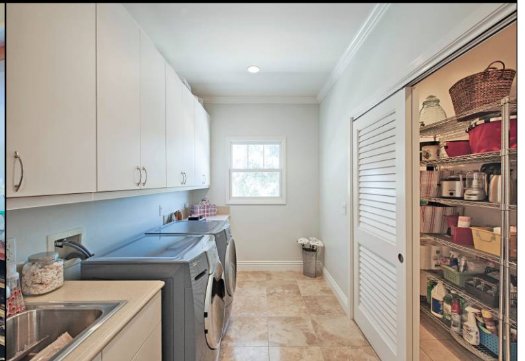
SPACIOUS LAUNDRY WITH PANTRY STORAGE