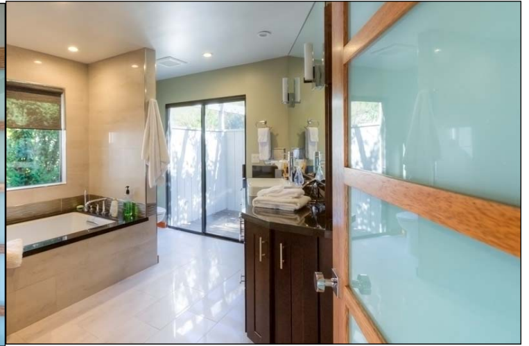
HER MASTER BATHROOM