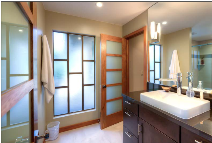
HIS MASTER BATHROOM