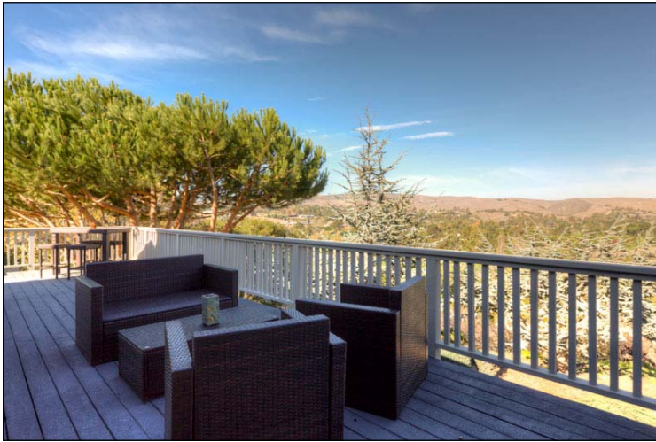
BEAUTIFUL DECKING WITH PANORAMIC VIEWS