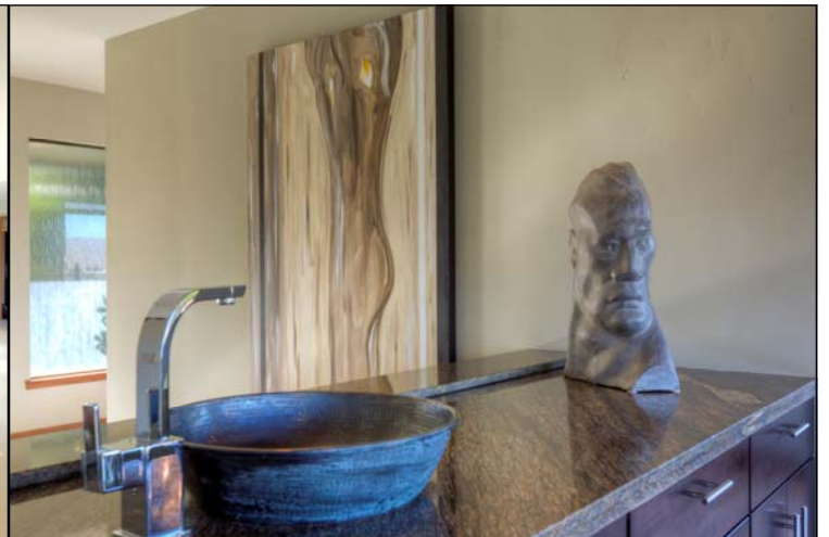
WET BAR WITH CABINETRY

300 SKY PARK DRIVE | MONTEREY | 831-333-9500 | #01260773