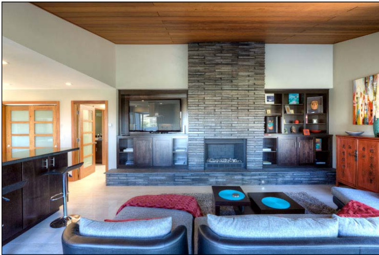
OPEN FAMILY ROOM