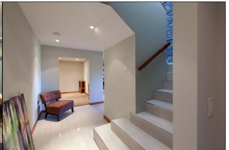
STAIRS LEADING TO DOWNSTAIRS