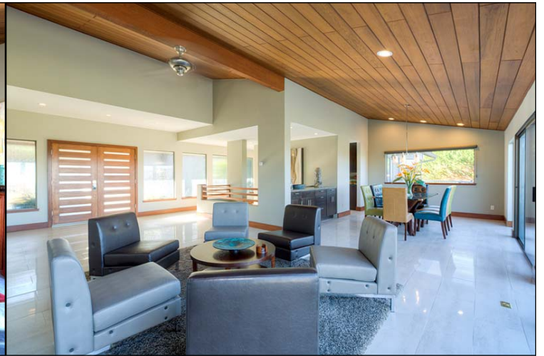
LIVING AND DINING ROOM