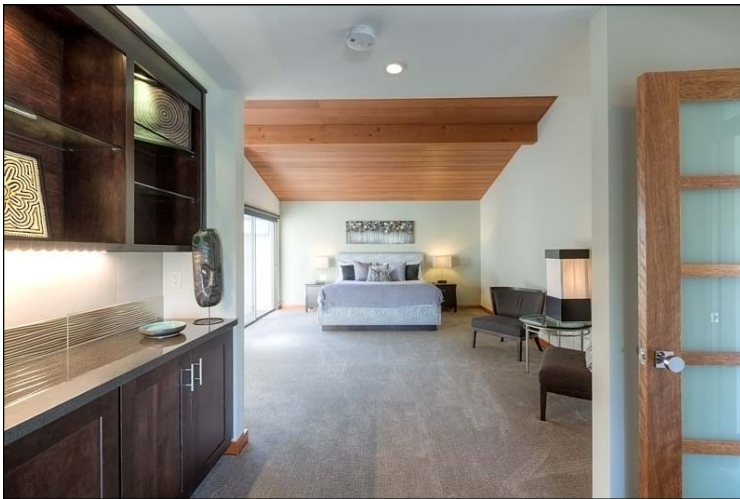
MASTER BEDROOM 1