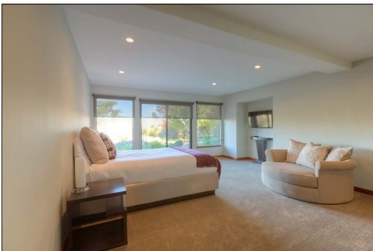
MASTER BEDROOM 2