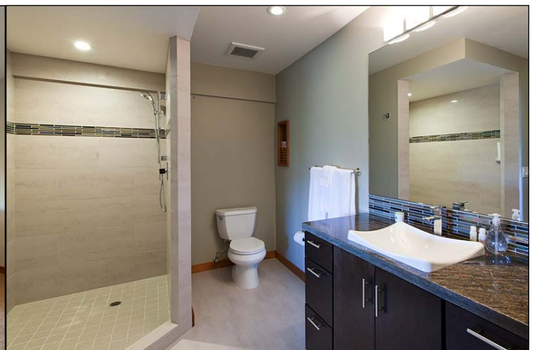
MASTER BATH DOWNSTAIRS

300 SKY PARK DRIVE | MONTEREY | 831-333-9500 | #01260773